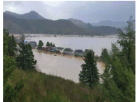
The National Flood Insurance Program serves to protect lives and property, while reducing costs to taxpayers due to flooding loss.

FEMA is evaluating proposed changes to the NFIP outlined in the Implementation Plan through an environmental impact statement (EIS), in compliance with the National Environmental Policy Act (NEPA).