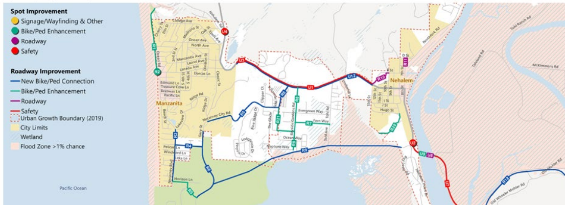
Figure 9 | Regional Projects

In addition, the Manzanita Trail Master Plan (2021) identifies proposed projects located outside of the park to mitigate issues. Master Plan for Trails in